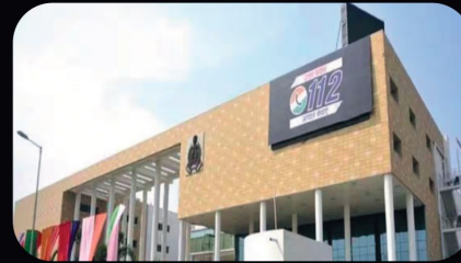
Dial 112 Office